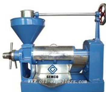
Performance Index (Hot extruding) YZS-80 (5.5kw)