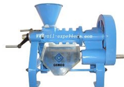
Performance Index (Hot extruding) YZS-68 (5.5kw)

Expellers are continuous in operation and work by grinding and pressing the raw material as it is carried through a barrel by a helical screw. The pressure inside the barrel, and hence the yield of oil, are adjusted using a 'choke' ring at the outlet