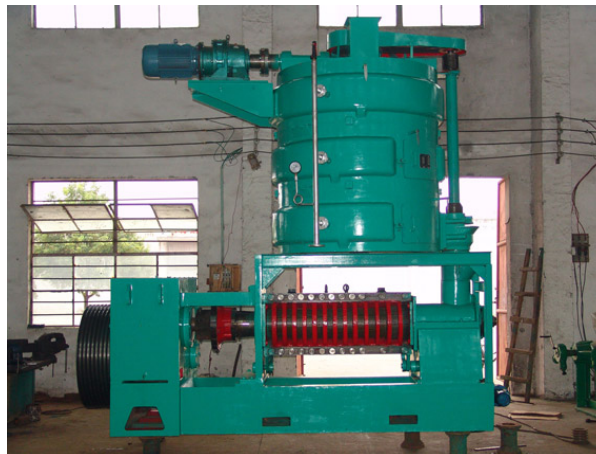
Main technical Data of Large bio diesel processing plants