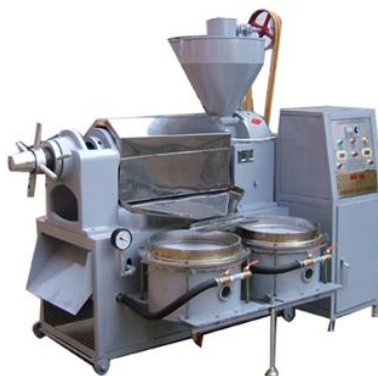
Main Technical Data of Oil press heated by electricity